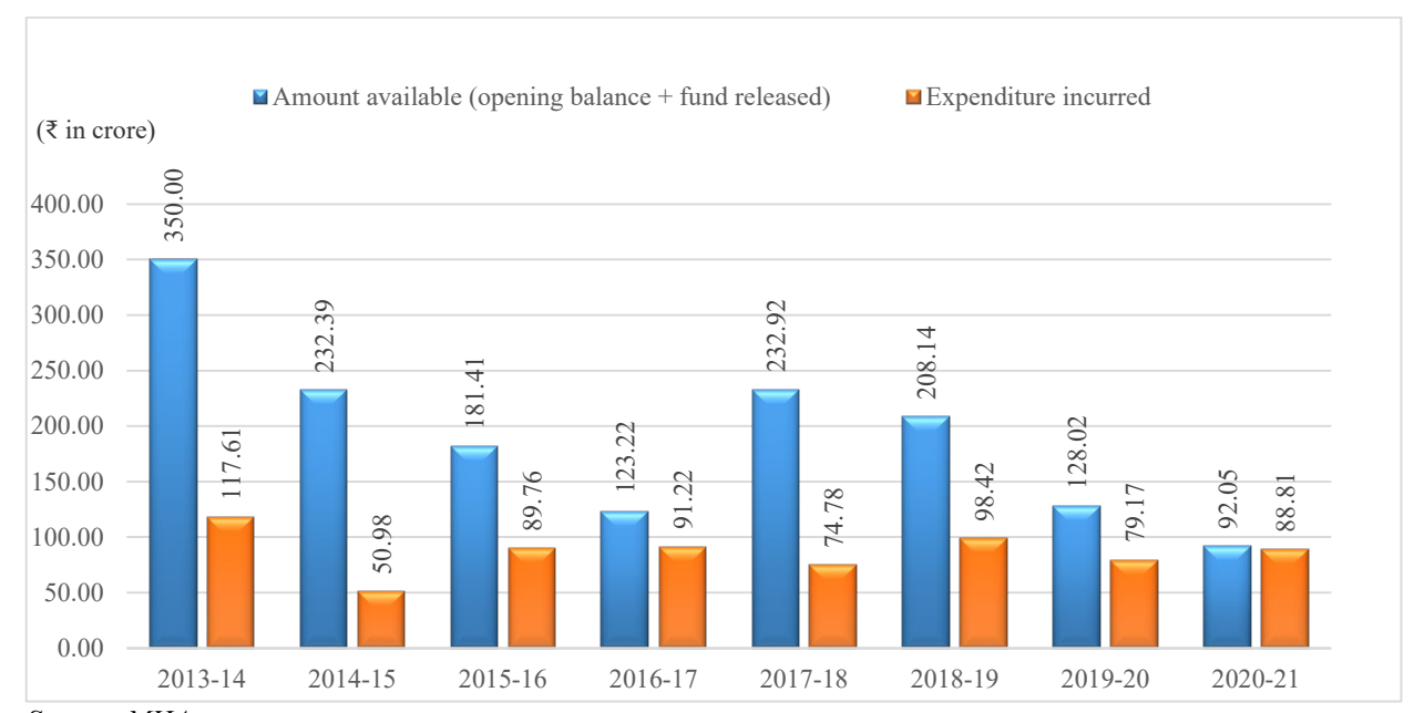
Chart No. 5: Funds available and expenditure incurred in Uttar Pradesh

Thus, the funds requisitioned in excess of requirement not only resulted in idling of funds in current account in the bank but also resulted in loss of interest.